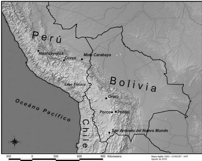
Figure 1. Andes cities and mines during the seventeenth century. Natural Earth ( www.naturalearthdata.com ), August 2010

centres by labourers from all corners of the Peruvian viceroyalty. The labouring population needed to be fed and kept supplied, and the people who brought the provisions – often from very distant places – also added to the population. In his Natural and Moral History of the Indies , Father Acosta noted: